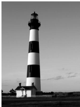
Coastal vacations are about relaxing. Trip Preserver lets you do just that.

TRIP PRESERVER™ from red sky travel insurance